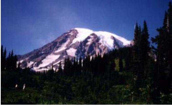
The Magic Mountain